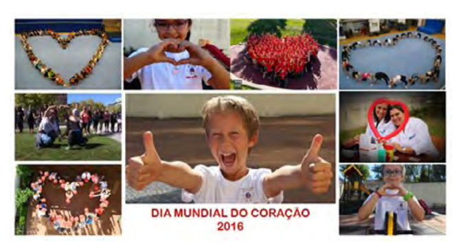
Portuguese Heart Foundation World Heart Day activities

The Director of Communications of the World Heart Federation presented the opportunities that the annual World Heart Day offers for creating awareness of the burden of cardiovascular diseases across low-, middle- and high-income countries. Looking forward to the 2017 World Heart Day, it is important to mobilise people across the world to ask that reliable and simple surveillance and systems for monitoring the burden and treatment of CVD are in place.