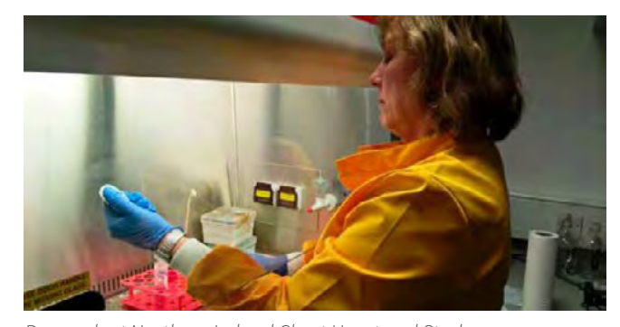
Research at Northern Ireland Chest Heart and Stroke

EHN concludes that completely replacing all animals in research is not yet possible. There is no alternative method that can reproduce the complicated working of our hearts and circulatory systems.