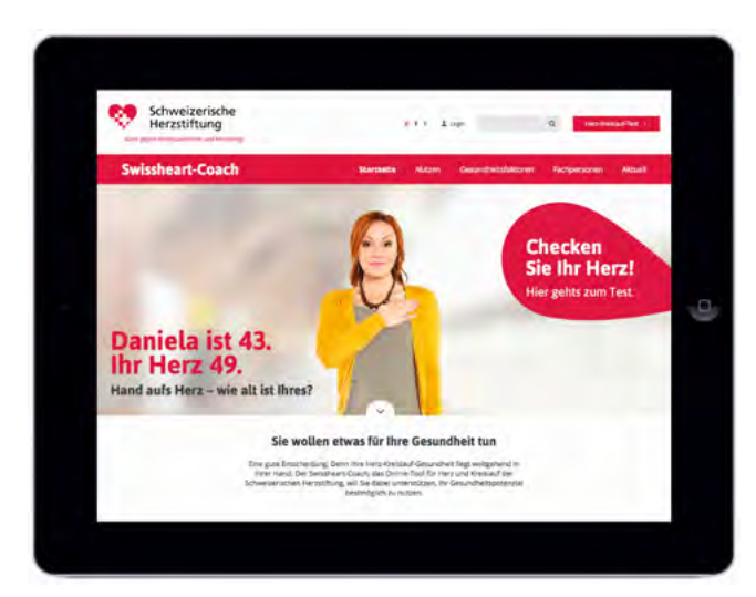
Swiss Heart Foundation "How old is your heart" campaign