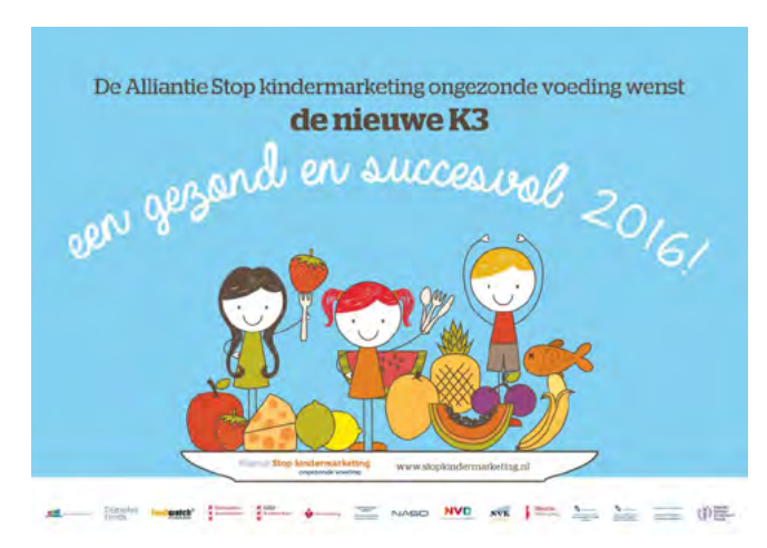
Dutch Heart Foundation campaign for a ban on licensed characters on unhealthy foods

EHN's recommendation is for the AVMSD to restrict effectively the exposure of children to commercial communications for HFSS food. To do so, the Directive needs to contain a prohibition of such commercial communications on television during all hours where children watch television, ideally between 06.00 and 23.00.